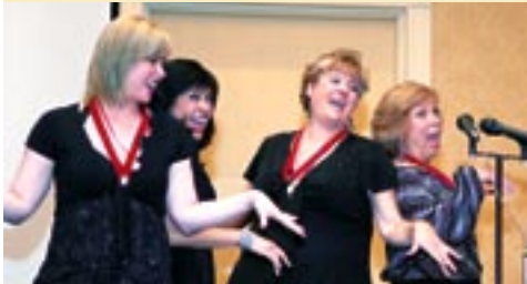
Charmed— Contestant #16 in Houston

Shimmer! joins our top two quartets UnLimited and Charmed (at left) and Touché