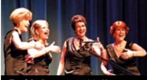
Touché— Contestant #13 in Houston

(see next page "Beyond the Golden West...") in earning a spot in the International Quartet Semifinals in Houston.