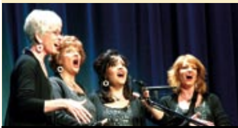
Shimmer!— Contestant #17 in Houston

In October 2010, at the Sweet Adelines International competition in Seattle, WA, Shimmer! earned 10th place medals and a return to competition in Houston. Though