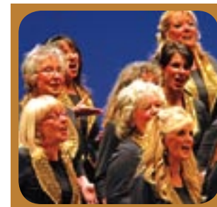
Mission Viejo was the Most Improved Chorus for the second year in a row – a total of 164 points in two years.

Harborlites wins the Region 21 Chorus Championship.